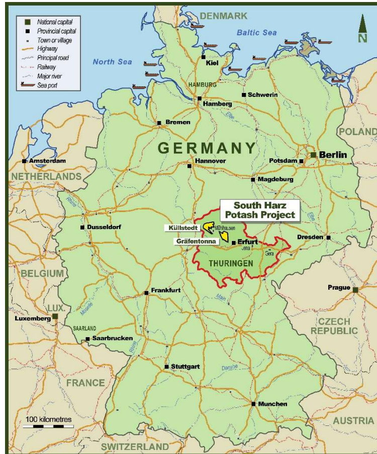
Figure 1 Location of South Harz Exploration Licences

The Gräfenonna Exploration Licence covers 216km 2 in Thuringen, central Germany (Figure 1), The South Harz region produced over 180 million tonnes of potash between 1880 and 1993 from underground mines. After Davenport’s IPO in January 2017 a detailed review of the extensive historical geological and exploration data from work carried out on and around the Gräfenonna licence was commissioned.